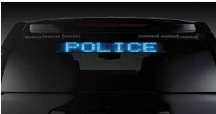
MB1 mounted on a Ford Interceptor Utility