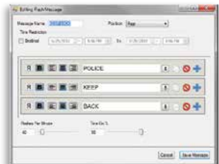
Customize messages are created and named using a PC based software.