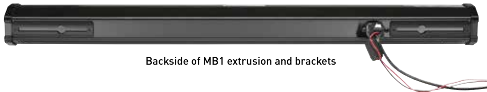
Backside of MB1 extrusion and brackets